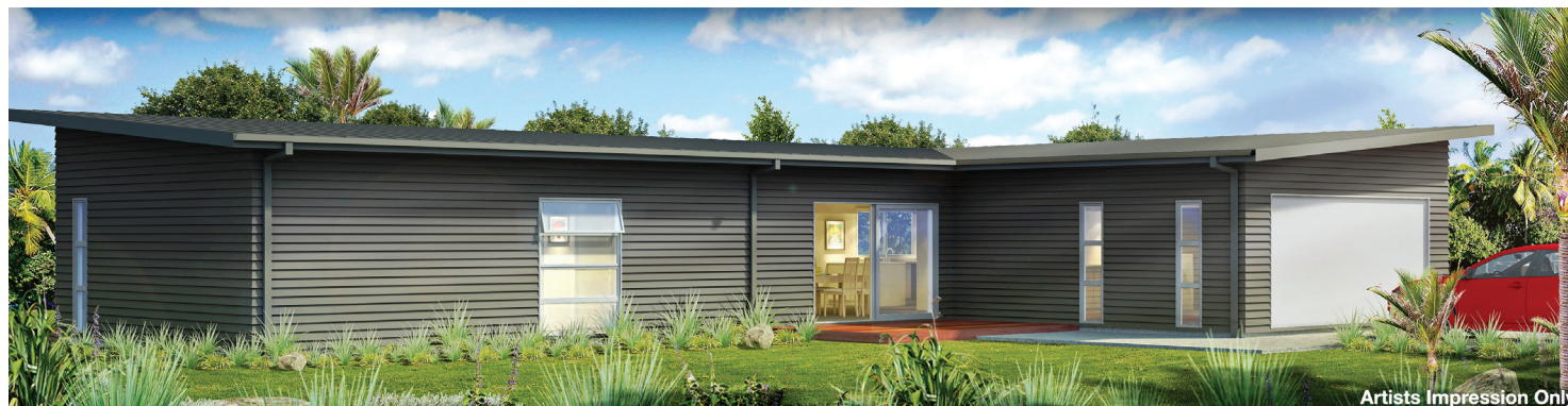
Artists Impression Only

Simple yet effective design makes highly efficient use of space, with open plan living/dining/kitchen, and decking the full length of the back of the house. The design is easy to tailor to your needs, and the functional bathroom is ideal for a young family.