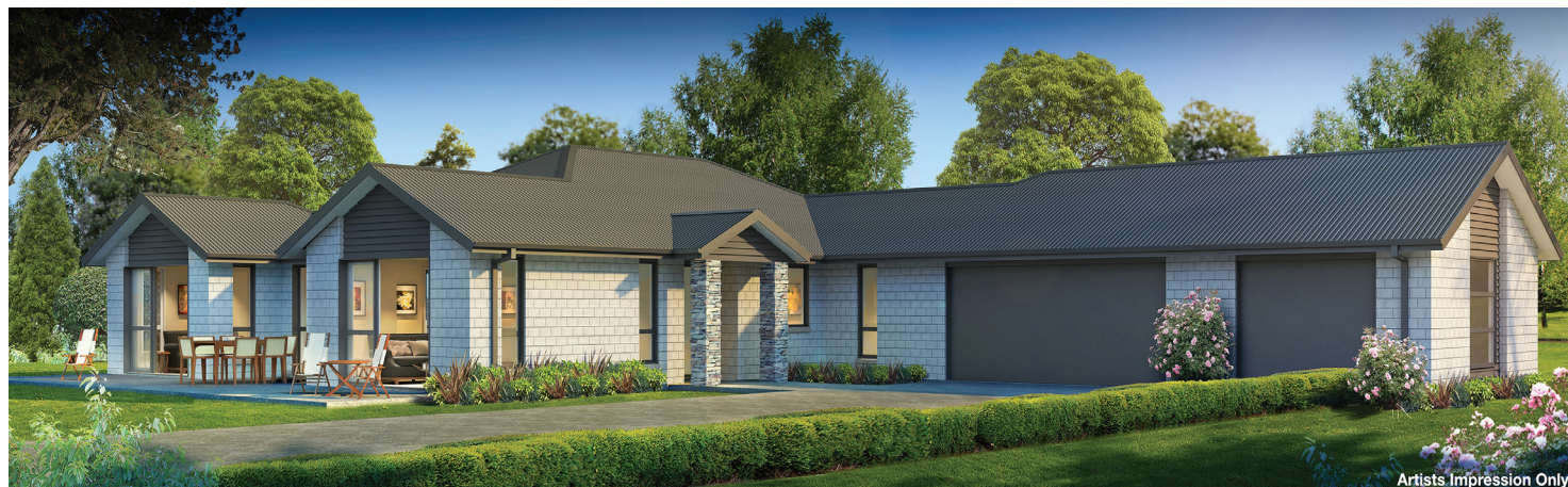
Artists Impression Only